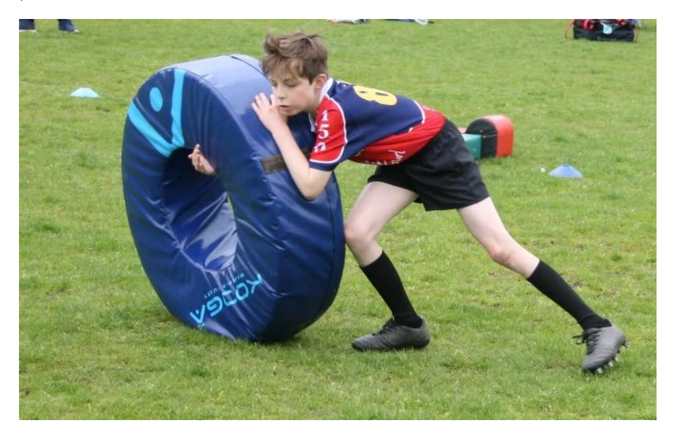
Get the date in the diary!!!

We are holding an open day on 20th August here at Avenue Street. There will be food stalls, activities for the kids, gin bar and lots, lots more for you and the family to enjoy. We'll be keeping you up to date with all the details as we get closer to the day. Keep your eyes peeled!