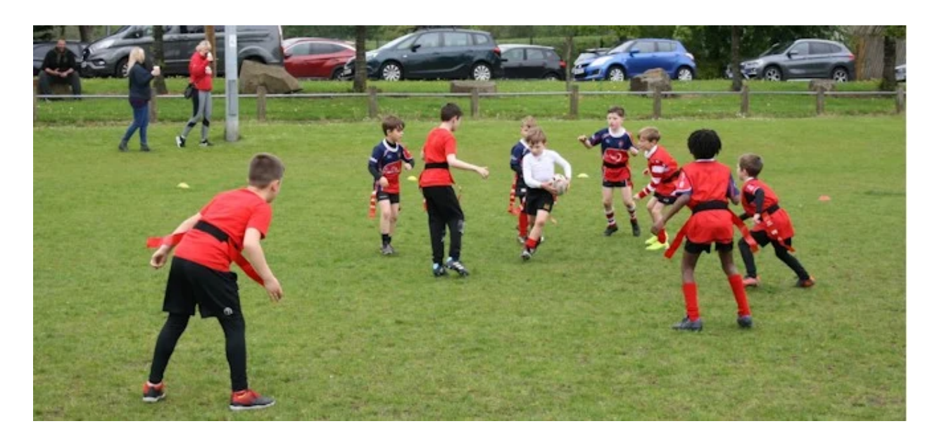
Bolton Rugby Union Football Club Limited Avenue Street Bolton BL1 3AW

If you think you'd like to undertake the role and want to find out more please get in touch by emailing <a href="mailto:volunteer@boltonrugby.co.uk">volunteer@boltonrugby.co.uk</a>